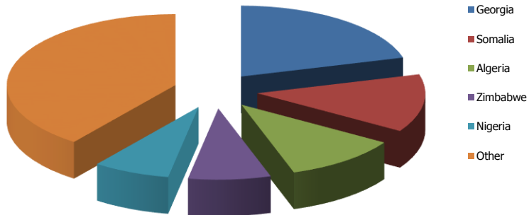
Applications in 2022 (30/09)